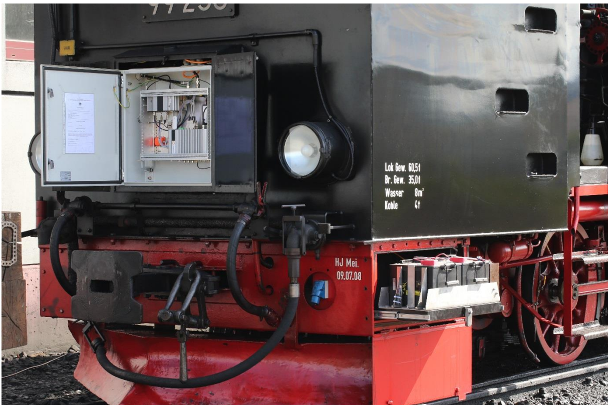
Figure 4: Installation on steam – tender locomotive.

All leading rail vehicles, i.e., locomotives, motorcars and possibly control cars, are equipped with a vehicle unit. This comprises a positioning and a communication component. The latter sends the own driving parameters continually via radio directly to all trains in the immediate surroundings and at the same time receives this information from other vehicle units in the vicinity. It can identify situations of potential conflict by comparison of own and received data.