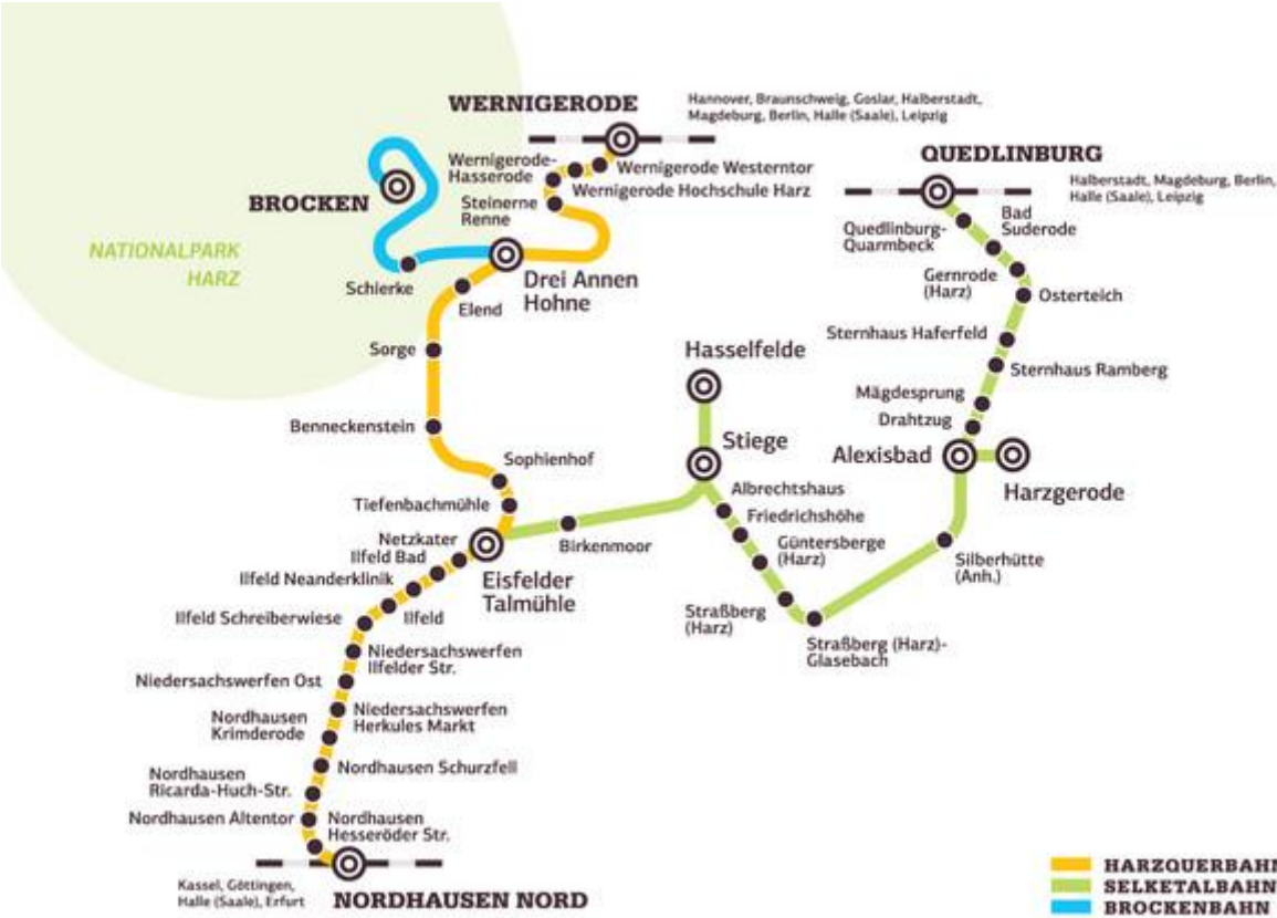
Figure 1: HSB Line Scheme (Graphics: HSB).

The company Harzer Schmalspurbahnen GmbH (Harz Narrow Gauge Railways, HSB) operates the metre-gauge railways in the Harz as an integrated railway-infrastructure and railway-transport company. The lines with a total length of 140 km form a closed railway network, with no connection to other railway networks (Figure 1). In Nordhausen Nord there is a track connection to the likewise metre-gauge Nordhausen tramway. The 400 m brake panels are valid.