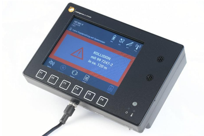
Figure 5: Display in the driver's cab (Photo: IoW).

time. Thereby – although it would be possible – in the basic version the system does not intervene directly with the train control. Rather, it functions as a train-driver assistance system. Possible collision points are ascertained dependent on path and speed, so that alarm signals don't come unnecessarily early.