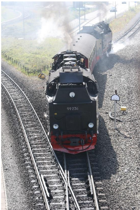
Figure 2: Impression Harz Narrow Gauge Railways (Photo: IoW).

When train traffic to the Brocken was taken up again on 15 September 1991 (Figure 2), there was a strong increase in the train density on the section Wernigerode – Drei Annen Hohne – Brocken. This led HSB to consider whether – in the long-term – the train-control operation between Wernigerode and the Brocken was still the correct way to operate.